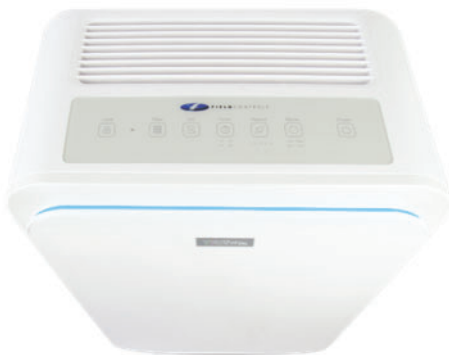
AIR QUALITY READING