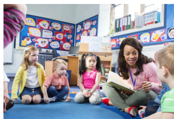
Day Care Facilities